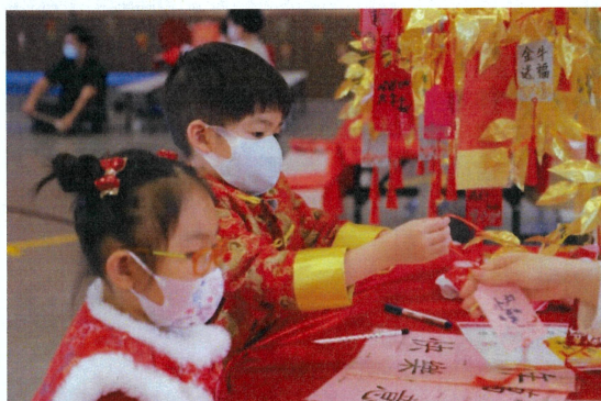
Chinese New Year Fair