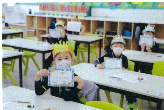
100 Days of School