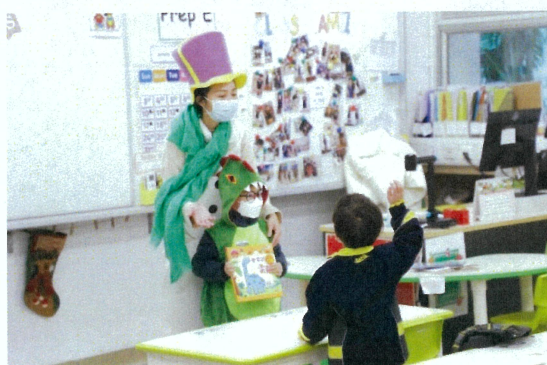
Book Character Day