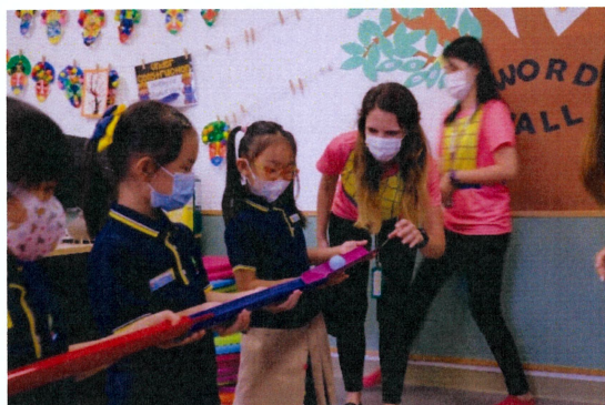
Christ Ambassador Day