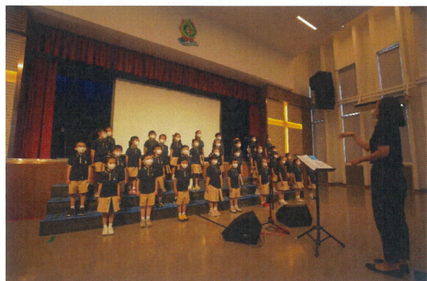
CAPCL students singing Hymn of Promises